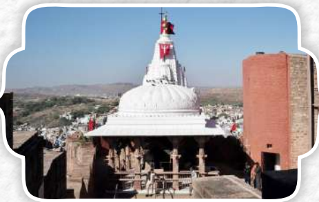
CHAMUNDA MATA TEMPLE