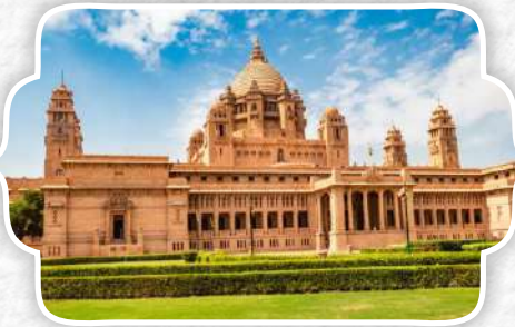
UMAID BHAWAN PALACE